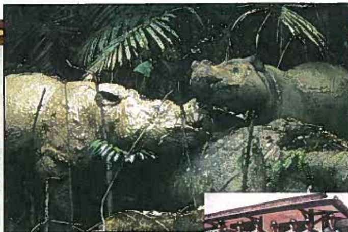
Wild Sumatran rhinos in southeast Asia are protected from poachers by specially trained rhino protection units.

The future appears pretty grim for our Sumatran rhinos, but there is hope because there are heroes fighting for the rhinos' survival. Rhino Protection Units (RPUs) in both Indonesia and Malaysia are patrolling the forests for poachers and removing snares set to trap the wildlife. These dedicated wildlife rangers put their lives on the line every day to help save the few