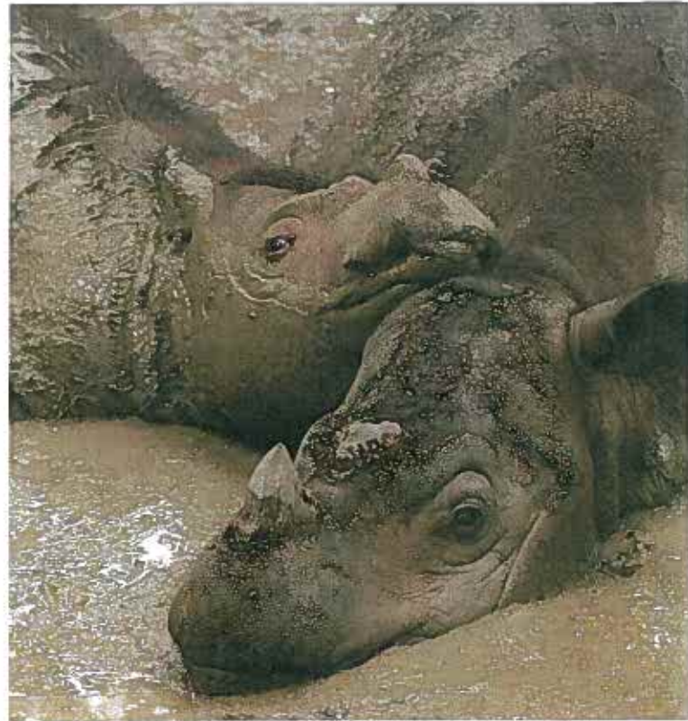
Sumatran rhinos spend much of their time in mud wallows to keep cool.