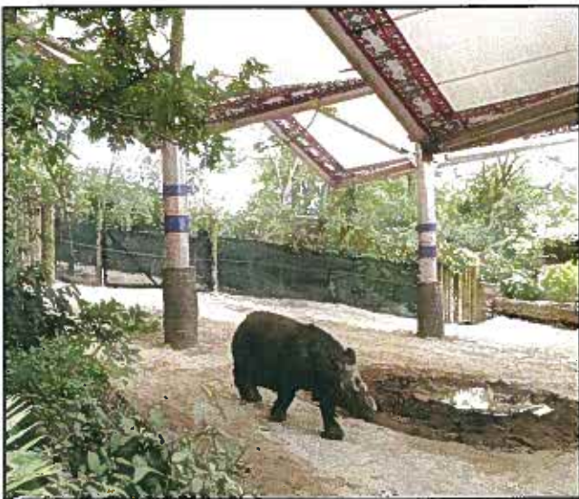
A custom designed, unique shade canopy structure protects our rhinos from too much sun.

Come see Emi and her new calf under their protective shade canopy at the Zoo – and don't forget your sunscreen!