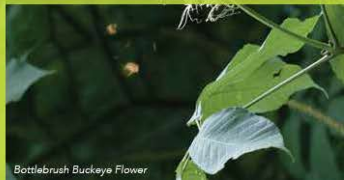
Bottlebrush Buckeye Flower

Experience the Botanical Side of the Zoo.