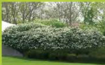
Fragrant Snowball Viburnum

For more information and photos, visit www.plantplaces.com .