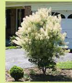
Young Lady Smokebush

Key: Full Sun ☀ Full Shade ☷ Native 🌿 Part Sun/Part Shade ☂ Wet Soil Tolerant 💧 Highly Recommended * Dies back to ground at 10°F ❄