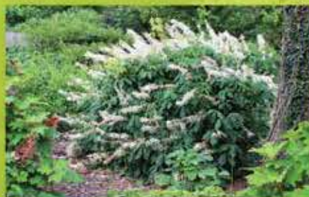
Roger's Bottlebrush Buckeye

Printing of this brochure was made possible by Stanley Smith Horticultural Trust. If you would like to support our efforts on this program or have any questions regarding the “Zoo’s Best” program please contact us at