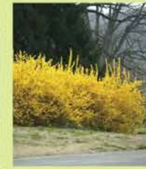
Lynwood Gold Forsythia