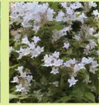
Pink Cloud Beautybush