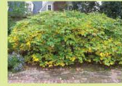
Bottlebrush Buckeye (Fall Color)