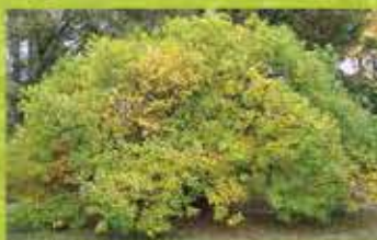
Fringe Tree (Fall Color)