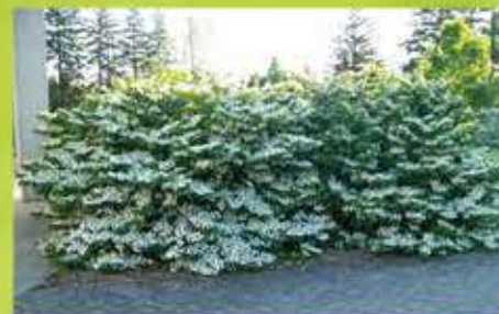
Shasta Doublefile Viburnum