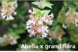
Abelia x grandiflora