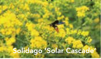
Solidago 'Solar Cascade'