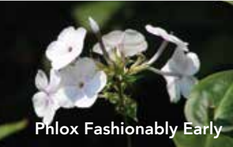
Phlox Fashionably Early