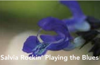
Salvia Rockin' Playing the Blues