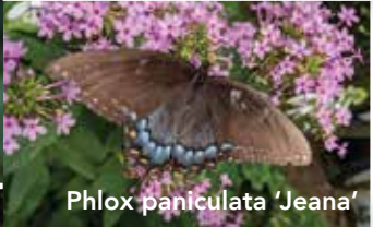
Phlox paniculata 'Jeana'