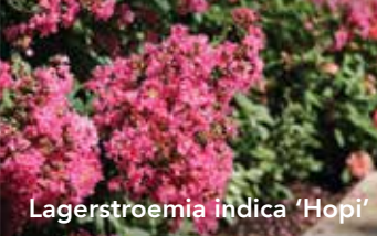
Lagerstroemia indica 'Hopi'