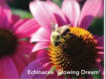
Echinacea 'Glowing Dream'