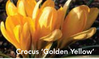
Crocus 'Golden Yellow'