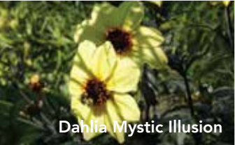
Dahlia Mystic Illusion