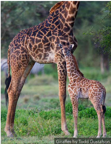
Giraffes by Todd Gustafson