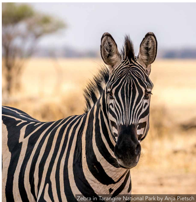
Zebra in Tarangire National Park

Cost is based on double occupancy; for a single room throughout the trip add $1,245 per person. A $500 per person deposit and enrollment form are required to reserve your space on the trip. This deposit is refundable (minus a $100 cancellation fee) until July 5, 2024, at which time non-refundable final payment is due.