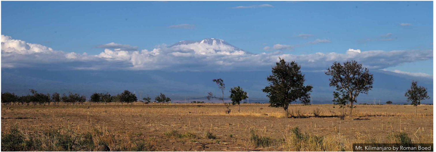
Mt. Kilimanjaro by Roman Boed