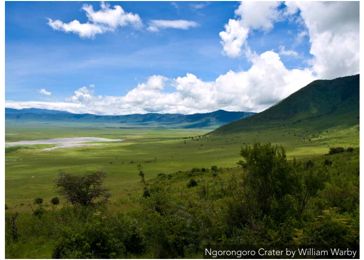
Ngorongoro Crater