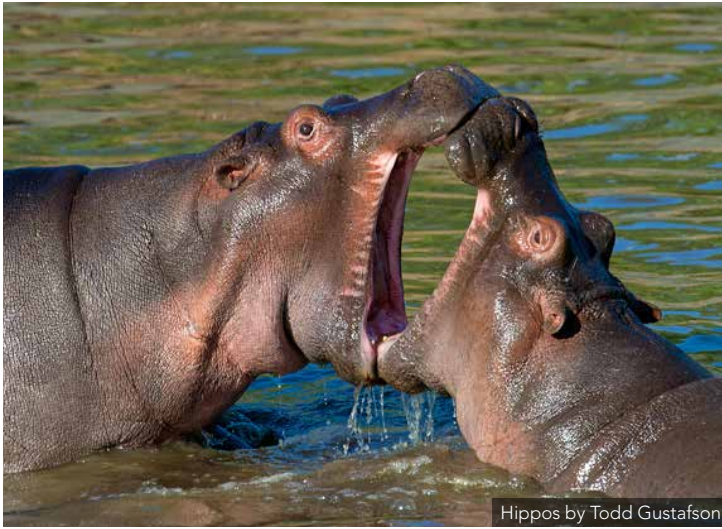
Hippos by Todd Gustafson