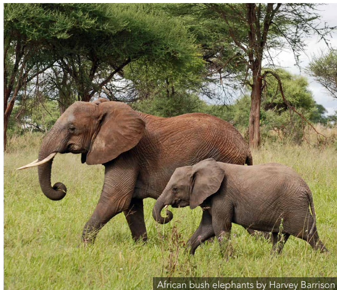
African bush elephants by Harvey Barrison