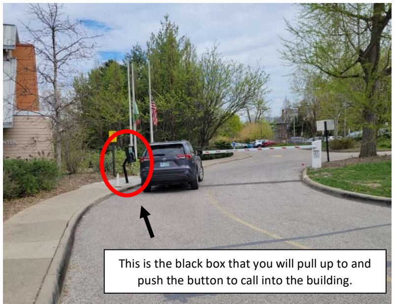
This is the black box that you will pull up to and push the button to call into the building.