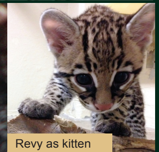
Revy as kitten