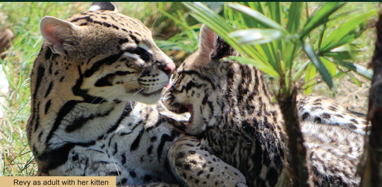
Revy as adult with her kitten

Lindner Center for Conservation and Research of Endangered Wildlife