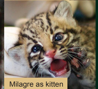
Milagre as kitten