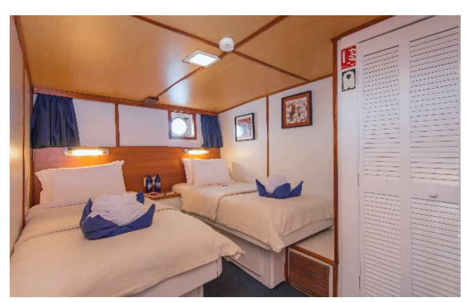
CATEGORY 1 DOUBLE: Lower Deck, Cabin 4 (twin beds)