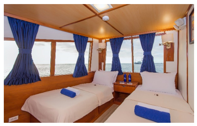
CATEGORY 2: Main Deck, Cabins 6 and 7 (2 Twins or 1 Double Bed)