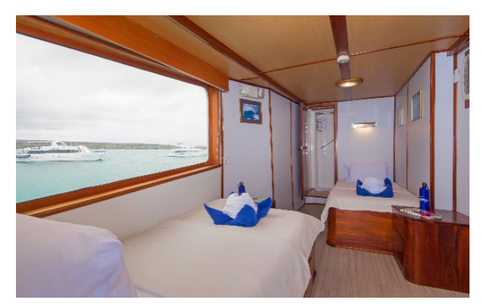
CATEGORY 3: Upper Deck, Cabin 8 (2 Twin beds)