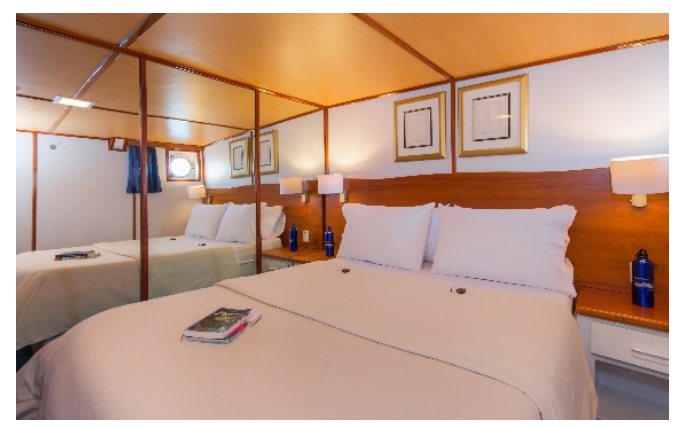
CATEGORY 1 SINGLE: Lower Deck, Cabin 3 (1 Double Bed)