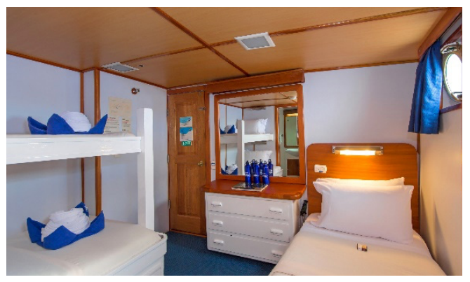
SPONSOR HOST CABIN SINGLE OR DOUBLE OR TRIPLE Lower Deck Cabin 1 (Two Lower Twins and One Upper)