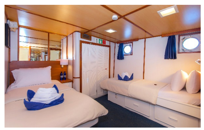
CATEGORY 1 DOUBLE: Lower Deck, Cabin 2 (twin beds)