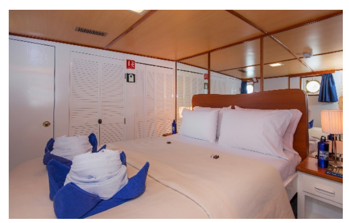
CATEGORY 1 SINGLE: Lower Deck, Cabin 5 (1 Double Bed)