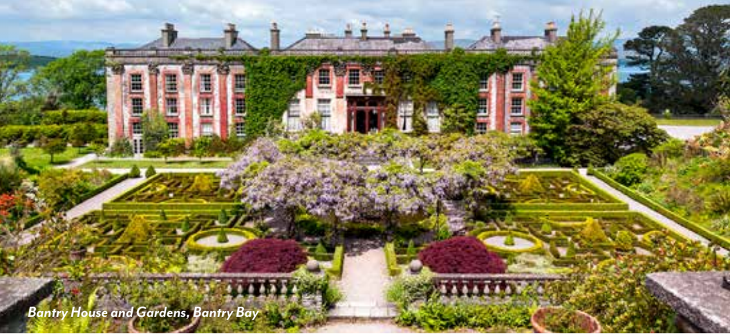
Bantry House and Gardens, Bantry Bay