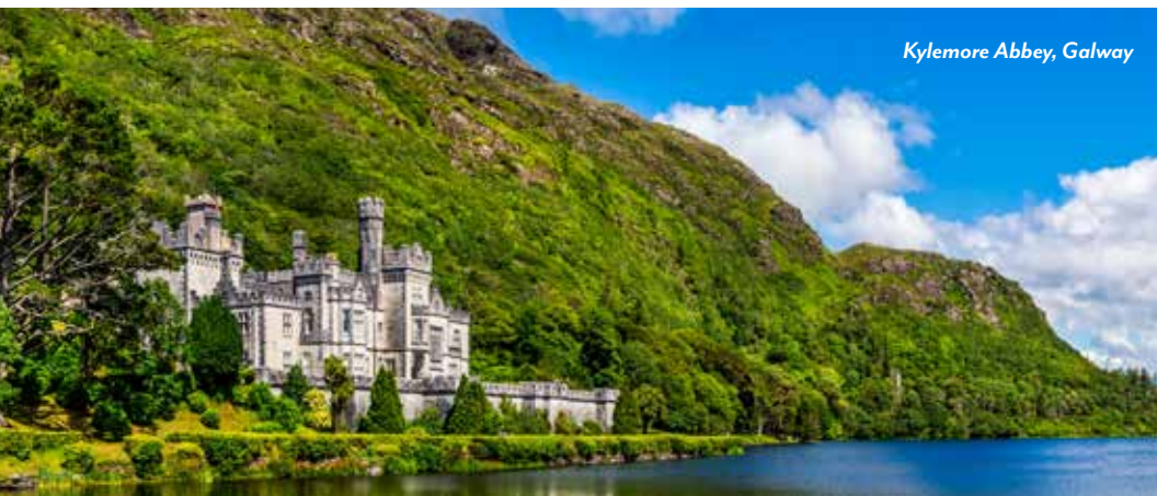
Kylemore Abbey, Galway

After breakfast, disembark and transfer to the airport for your return flight home. (B)