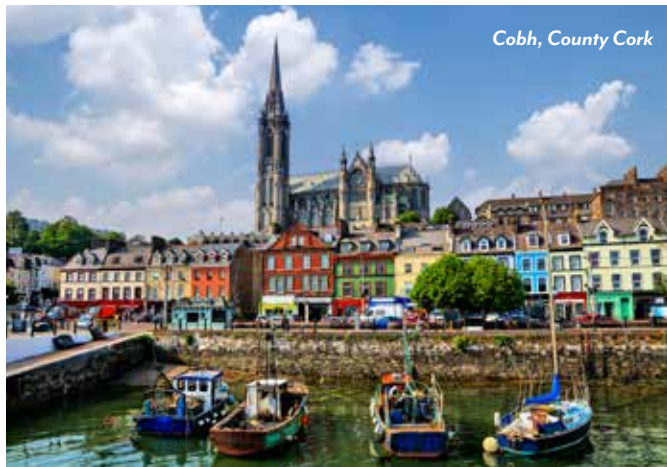
Cobh, County Cork

In Galway, select from two included excursions. On the first choice, admire the Wild Atlantic Way's dramatic splendor at the Cliffs of Moher and The Burren. Enjoy a guided walk across The Burren's karstic landscape and watch waves crash below you from breathtaking cliffs 700 feet above the ocean. Your other option takes you through brooding scenery of rugged mountains and windswept bogs as you explore some of