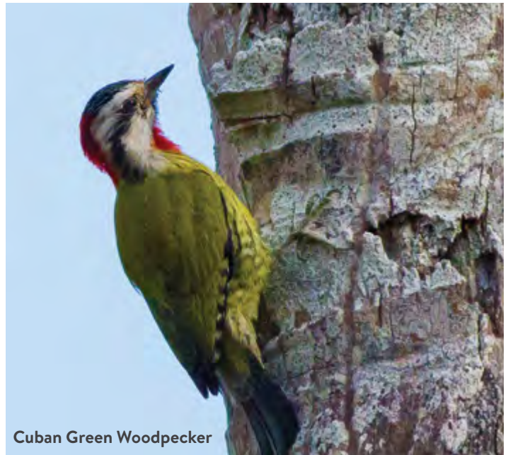
Cuban Green Woodpecker