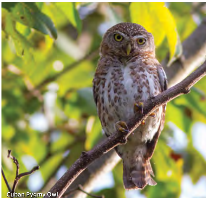
Cuban Pygmy Owl