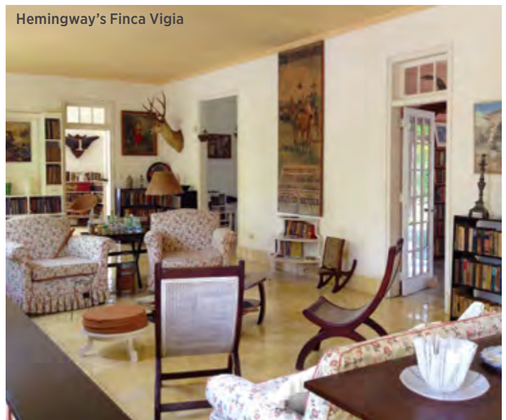
Hemingway's Finca Vigia