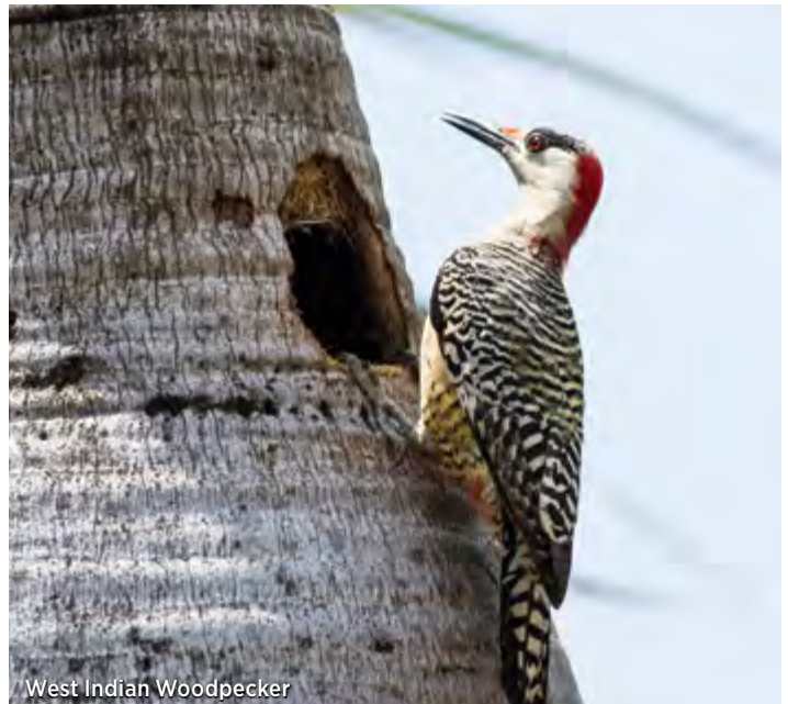
West Indian Woodpecker

Foundation for Nature and Humanity (FANJ) is a Cuban cultural and scientific nongovernmental institution, dedicated to research and promotion of programs and projects for the protection of the environment as it relates to culture and society. Its main focuses are on stakeholder engagement, poverty reduction and land restoration.