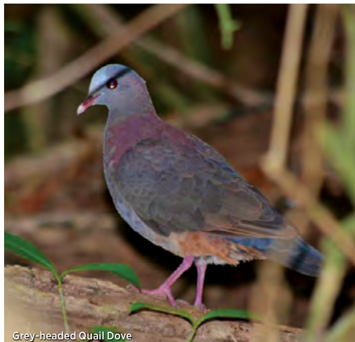
Grey-headed Quail Dove

Las Sabanas de Soplillar (Savannas of Soplillar) – A key location for spotting Bare-legged Owl, Cuban Pygmy Owl, Fernandina's Flicker, Cuban Parakeets, and Cuban Parrots. Just after sundown, we'll also search for the Cuban Nightjar.